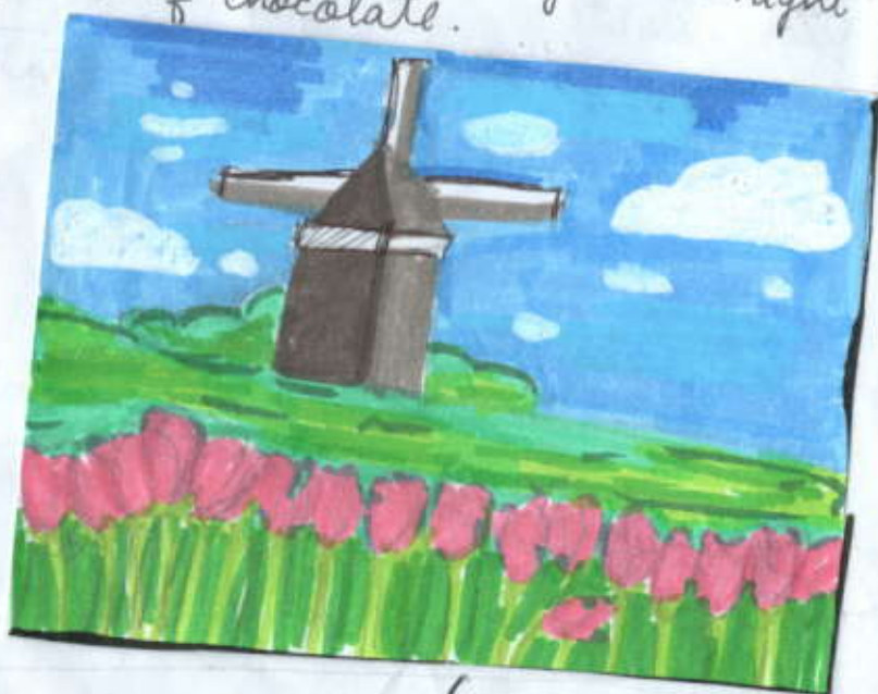
Tulip Fields, Netherlands

more than a quarter of Netherlands is below the mean sea level?