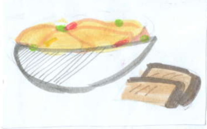
Chain Bridge, Budapest (Hungary)

Now let us continue our journey and uncover two more hidden realms.