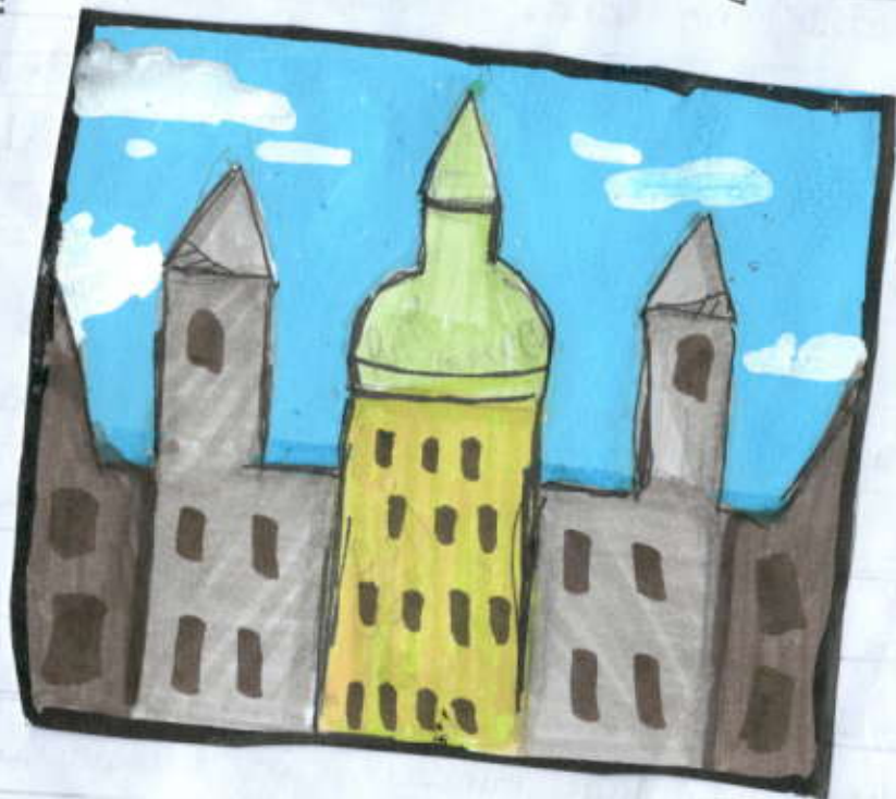
Prague Castle, Czech Republic

The region's history is marked by the formation and hard rivalry of different states and empires. The history of East Europe is characterized by the rise and fall of empires, the everlasting tinge of excitement and the development of culture and technology. Travelling further to the past, the Homo Sapiens arrived in Europe around 46,000 - 43,000 years ago. Moving on to the amazing cultural unity of this glorious place, historic wars still send shivers down people's spines. Lets start by giving you a bone-chilling example: After the East-West schism of 1054, Eastern Europe developed cultural unity under the Eastern Orthodox Church and the Cyrillic alphabet. In the medieval time, many waves of people settled in Eastern Europe including many tribes, vikings and even Mongols! Scary right? Imagine having to live with vikings!!