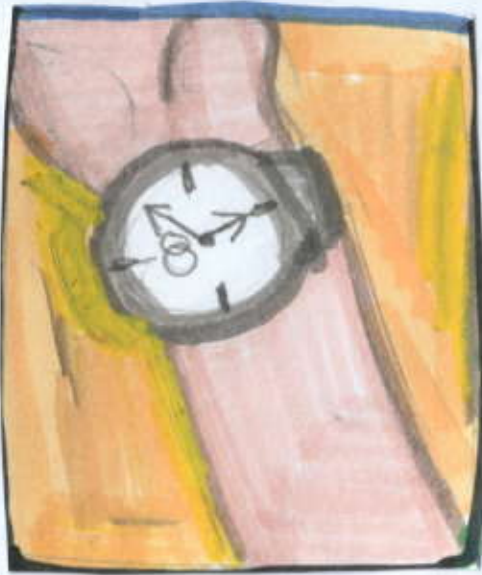
Swiss watches, Switzerland