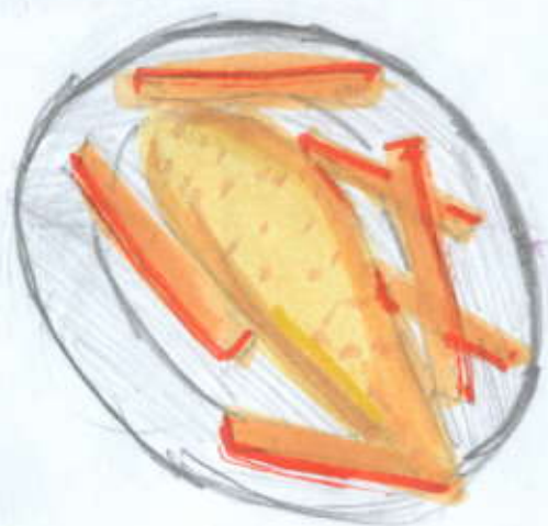
Fish and chips, London (UK)

Well, sadly our time here has come to an end. However, we will be sailing to another beautiful part of Europe and we hope to see you there, but for now let us say goodbye to the City of Love, or as they would say, "au revoir!"